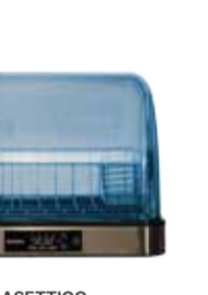
ASETTICO SD 0630 U