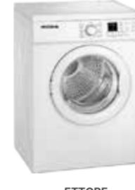
ETTORE ED 770