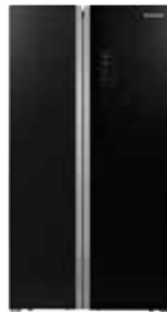
GIULIA RF 2552 L