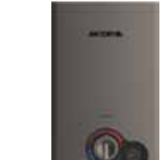
RAPIDO GI 1020/0620 B