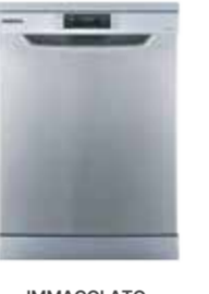
IMMACOLATO WP 7121 S