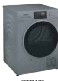
EFFICACE ED 8107 G