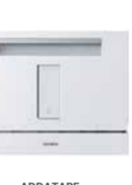
ADDATARE WP 2060 S