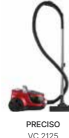
PRECISO VC 2125