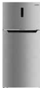
ARGENTO RF 2255 S