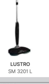
LUSTRO SM 3201 L