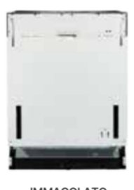
IMMACOLATO ED 8107 S