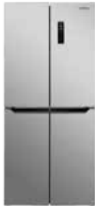
ARGENTO RF 4540 S