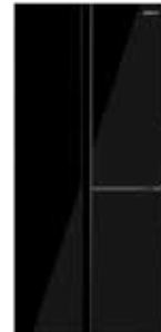
VETROLIA RF 2555 L