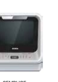
SEMPLICE WS 1020 G