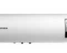
DISTESO ES 30/50/80/100HD

GENERAL INFORMATION : TITANIUM PORCELAIN ENAMEL, MAGNIHEALTH TECHNOLOGY, AG+ANTIBACTERIAL, DOUBLE THERMOSTAT, ELOC SAFETY, PRESSURE RELIEF VALVE, POWER CONTROLLER, AUTO CUT-OFF, FLAME OUT SAFETY.