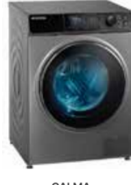
CALMA WF 1156 D