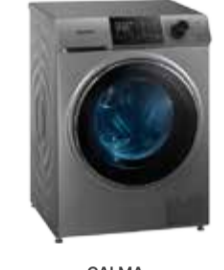
CALMA WD 1157

GENERAL INFORMATION | WASHER : MULTIPLE WASHING PROGRAMS, INVERTER MOTOR, UNIVERSAL MOTOR | DRYER : MULTI DRYER PROGRAMS, ANTI CREASE IRON, DELICATE PROGRAM | DISHWASHER : STAINLESS STEEL DOOR, WATER OVERFLOW PROTECTION, SPIN JET TECHNOLOGY, INSTALLATION FREE.