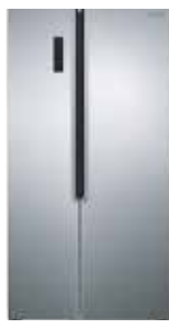
ALLEGRA RF 2551 S