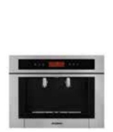
VICINO BP 3435