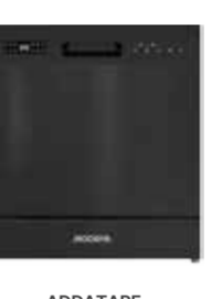
ADDATARE WP 2080 SKY