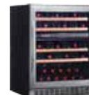
SCUDERIA WC 2045 S