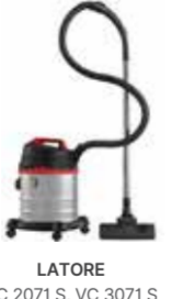
LATORE VC 2071 S, VC 3071 S