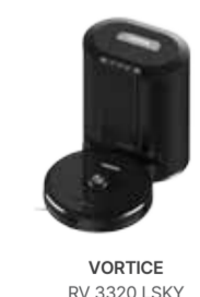
VORTICE RV 3320 LSKY

GENERAL INFORMATION : CYCLONE TECHNOLOGY, WASHABLE HEPA FILTER, POWER CONTROLLER, SUCTION CONTROLLER, WET SUCTION, 5 LAYERS DUST FILTER, DUST BAG INDICATOR.