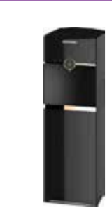
IGIENICO RO 8115